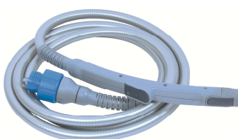
Ergonomic steam hose and handle