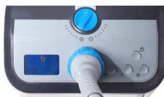
Sensitive switches and LCD control screen