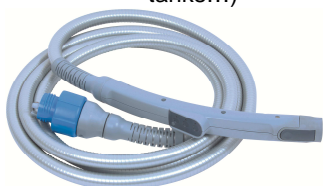
Ergonomic steam hose and handle