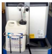
Connexion with tank MV600-2L

To be used exclusively with : MV600H-2L : 2 litres tank of hydrogen peroxide solution 7,9%)