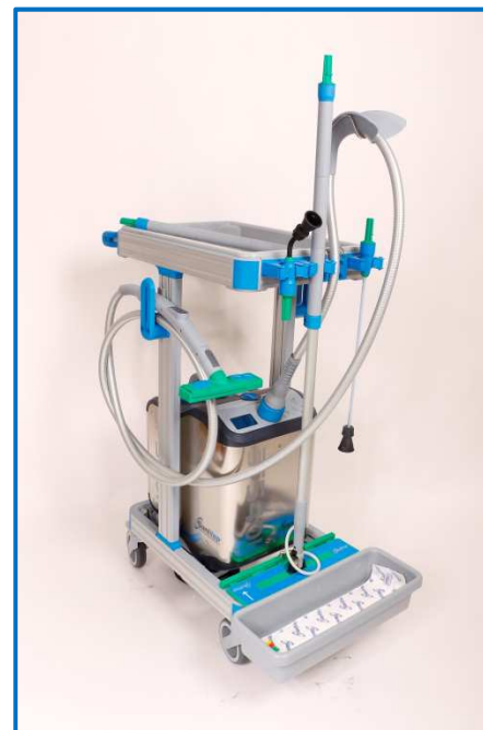
SP540HKIT with accessories

The SP540H can also be used for steam only biocleaning operation