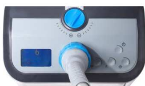
Sensitive switches and LCD control screen